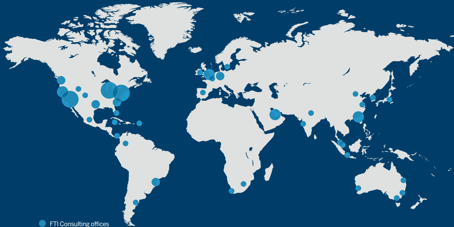
● FTI Consulting offices

Advisor to 8 of the world's top 10 bank holding companies