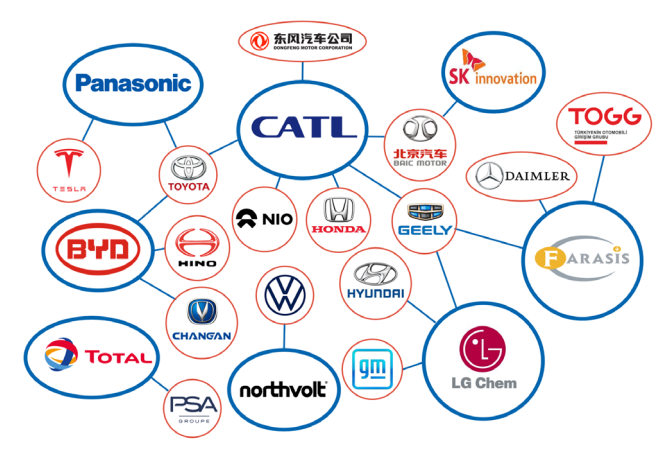
FIGURE 4 - MAJOR OEMS JVS WITH BATTERY MANUFACTURERS