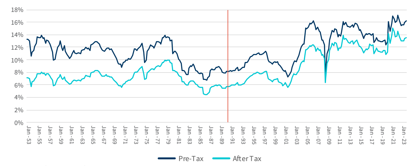
Figure 2 - Corporate Profits as a Percent of National Income