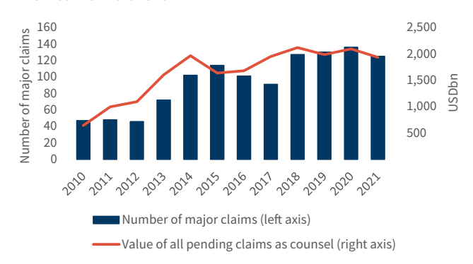
FIGURE 2 - NUMBER OF MAJOR CLAIMS AND AGGREGATE VALUE OF TOTAL CLAIMS IN THE GAR 30 FROM 2010 TO 2021

Note: GAR classified claims as "bet-the-company-hearings", which we have termed 'major claims" in this table, if they exceeded USD 900 million (2010-12) or USD 1 billion (2013-21). Source: GAR 30, 2010-2021; The GAR 30 Commentary and Analysis, 2012 and 2013.