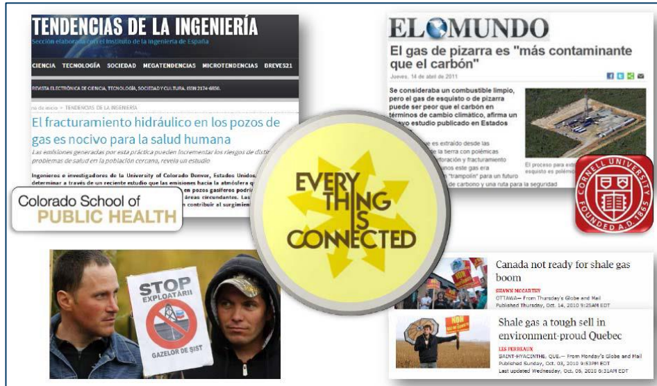
Figure 1. Everything is Connected

In an interconnected world, the pace is faster and the stakes much higher. Local problems can become national or global very quickly and projects can go from success to failure in a matter of days, even hours. For this reason, these risks must be dealt with on multiple fronts and on a continuous, near-real time basis. To fully mitigate aboveground risks, an all-encompassing communications and rapid response effort that focuses on education and outreach specific to the issues and crisis at hand is needed. But creating a program of this sort, one that is rapid and successful in meeting objectives, has its own challenges and tactical considerations.